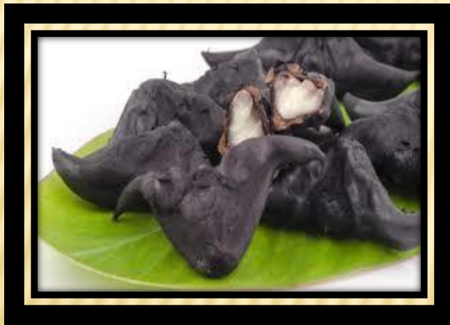
WATERCHESTNUT ( SINGHARA)