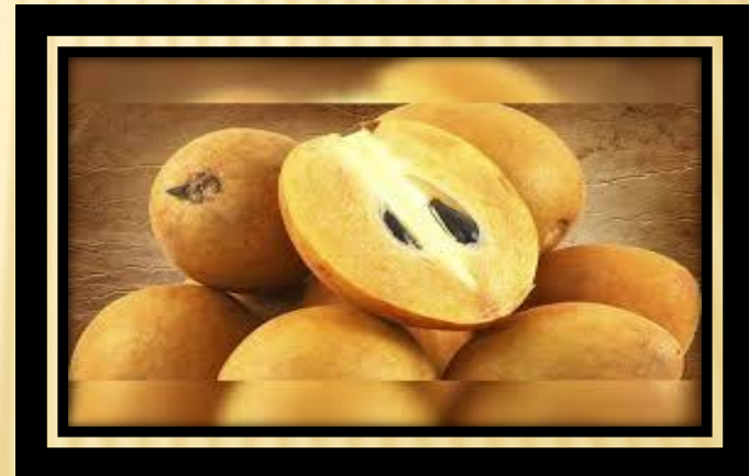
SAPODILLA ( CHIKOO)