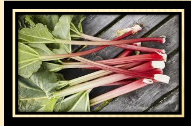
RHUBARB ( RHUBARB)