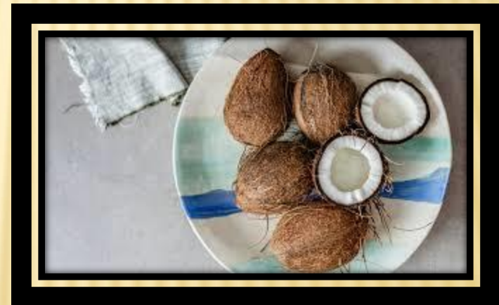
COCONUT ( NARIYAL)