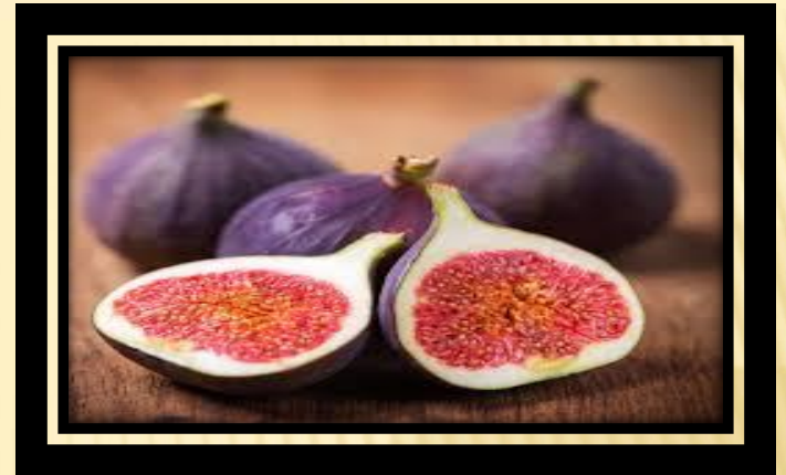
FIG ( ANJEER)