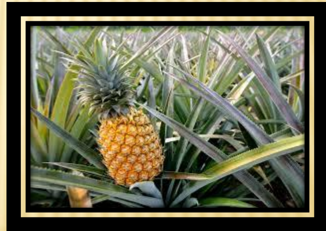
PINEAPPLE ( ANAANAS)