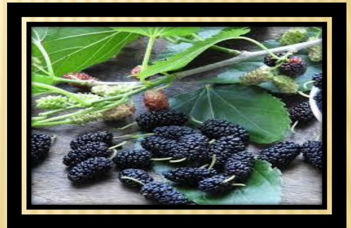
MULBERRY ( SHAHTOOT)