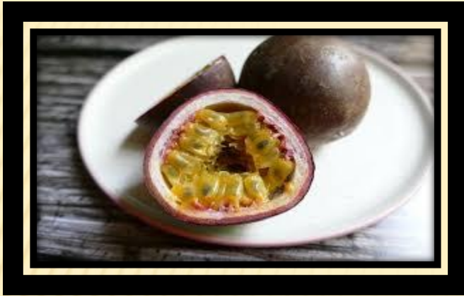
PASSION FRUIT ( KRISHNA PHAL )