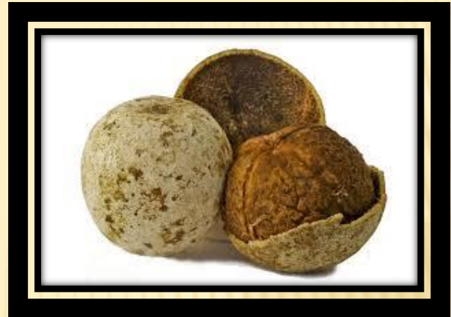
WOODAPPLE ( BEL)