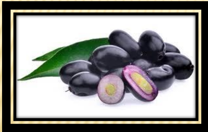
BLACKBERRY ( JAMUN)