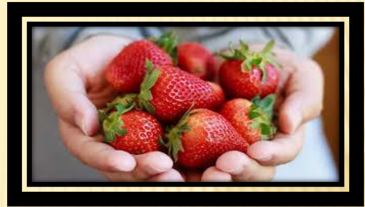
STRAWBERRY ( SHARBHEY)