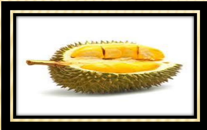
DURIAN ( DURAIN)