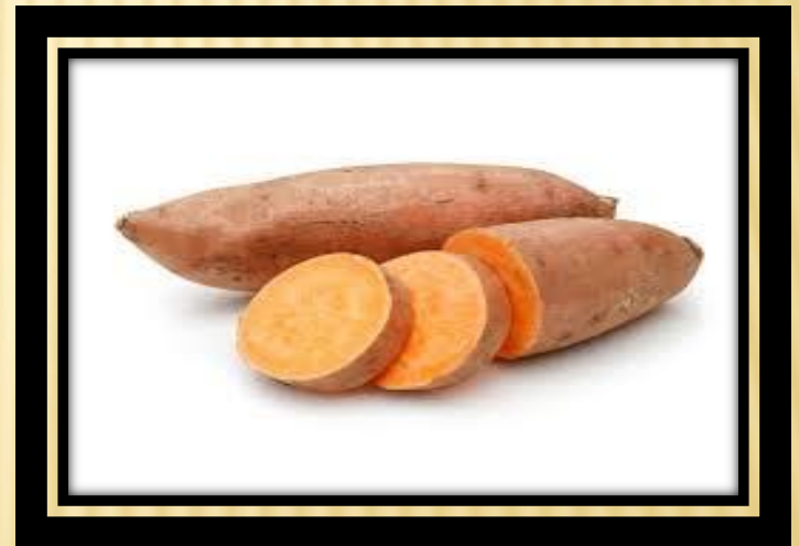
SWEET POTATO ( SHAKARKAND)