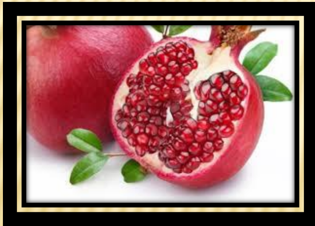
POMEGRANATE ( ANAAR)