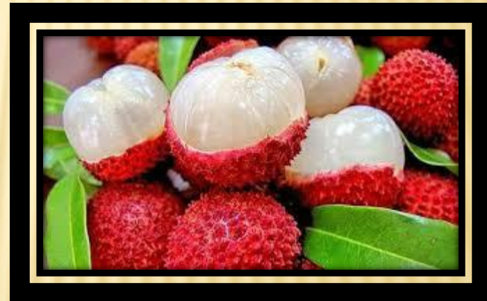
LITCHI ( LICHI )