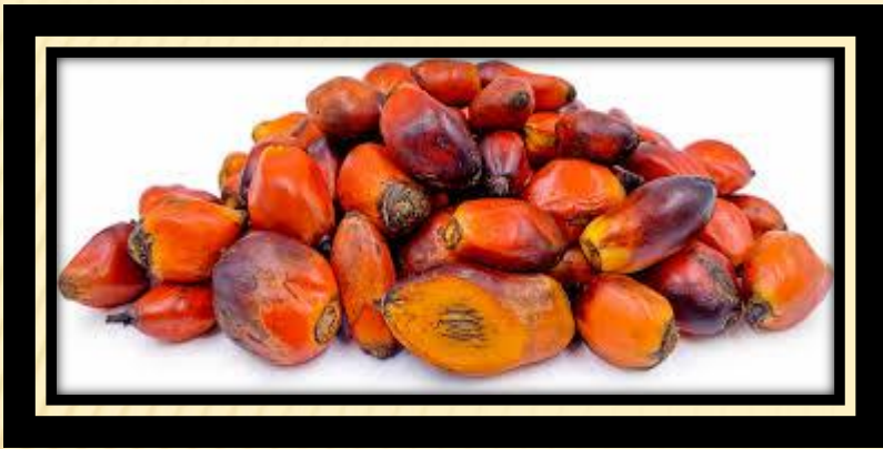
PALM FRUIT ( TADH KA FRUIT)