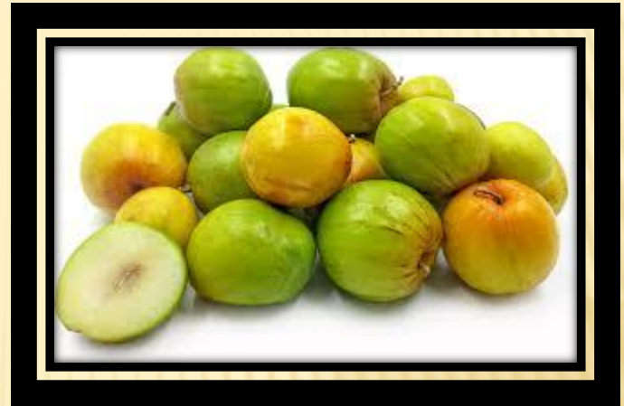
PLUM ( BER)