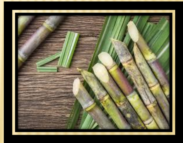
SUGARCANE ( GANNA)