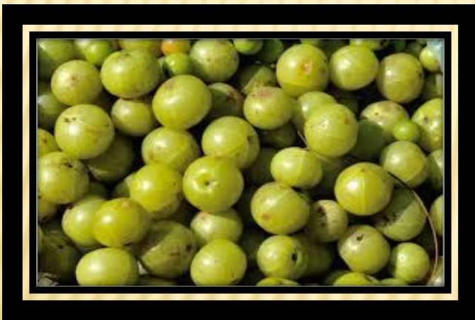
GOOSEBERRY ( AMLA)