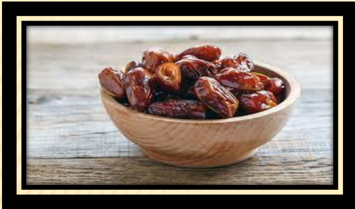
DATE ( KHAJOOR)