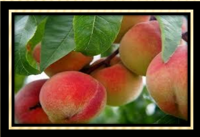
PEACH ( AADOO)