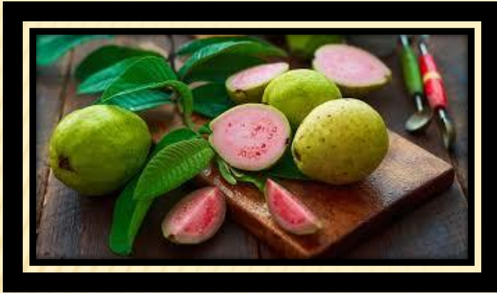
GUAVA ( AMROOD)