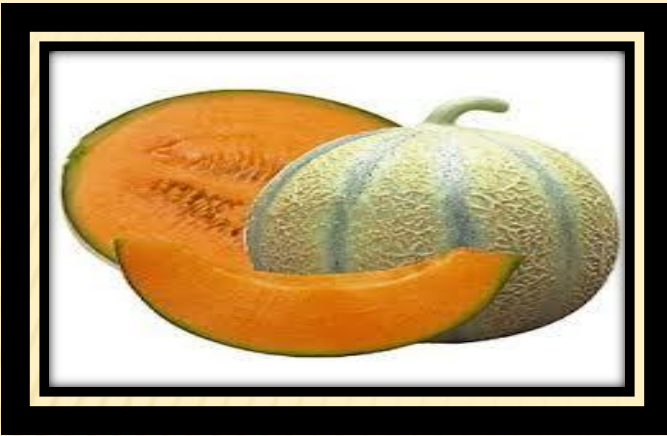
MUSKMELON ( KHARBUJA)