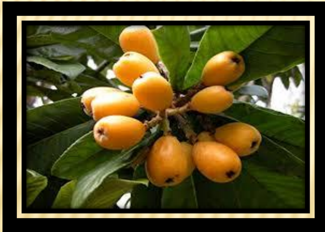
LOQUAT ( LOKAT )