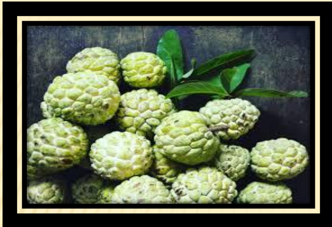
CUSTARD APPLE (SITAFAL)