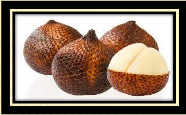
SNAKE FRUIT ( SNAKE FRUIT)