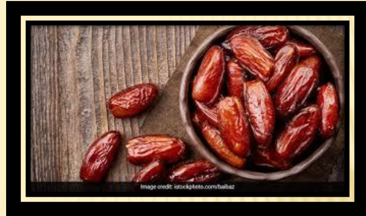
DATES ( KHAJLOOR )