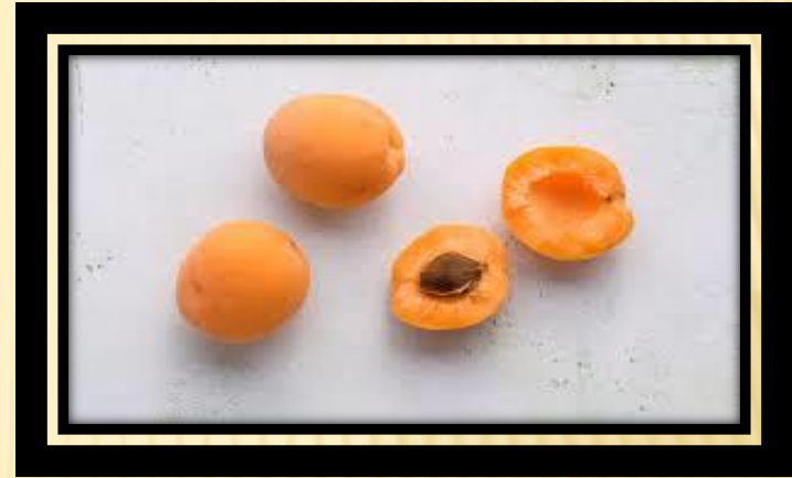
APRICOT ( KHUBANI)