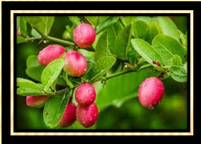
GOOSEBERRY ( KARAUNDA)