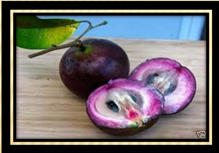
STAR APPLE ( SITARA PHAL)