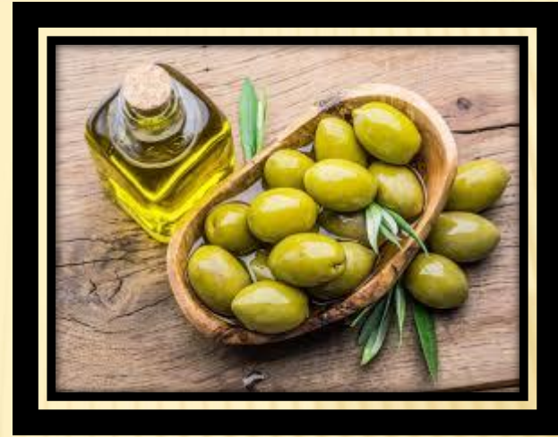
OLIVE ( JAYTOON)