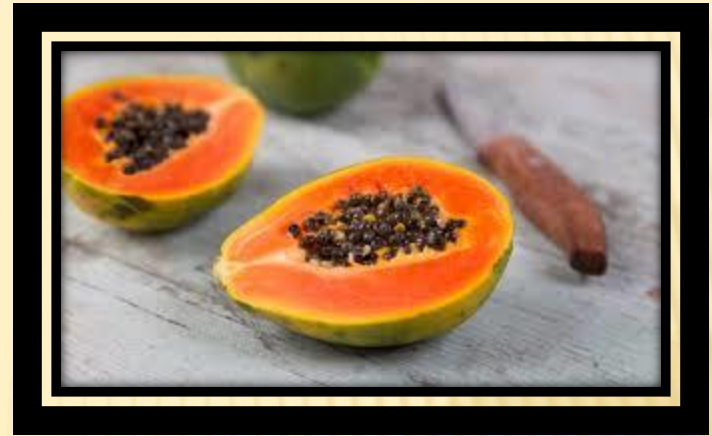
PAPAYA ( PAPITA)