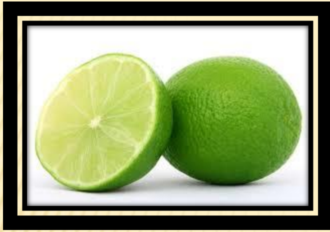
GRAPEFRUIT ( MAUSAMI)